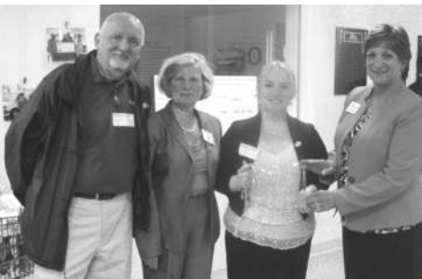
Rotary Club of Littleton receiving the 2015 Outstanding Community Partner Award in June