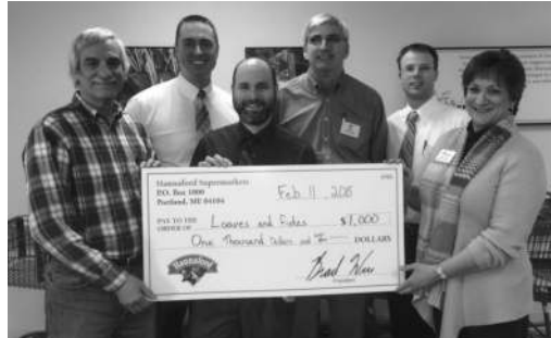
Hannaford Supermarket in Ayer has supported Loaves & Fishes for many years, and we were sad to see the store close!