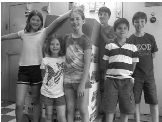
4th graders at Hildreth Elementary School in Harvard held a school-wide food drive for Loaves & Fishes