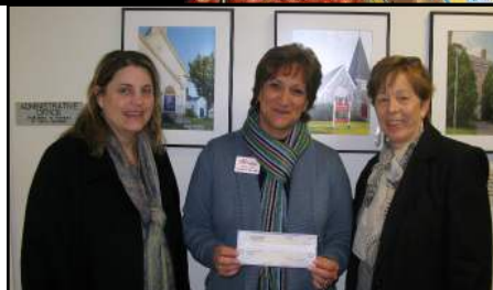
(Pictured right) Nashoba Nursing Service & Hospice presented our Executive Director with a very generous donation this holiday season!

291 families received all of the fixings for their holiday meal.