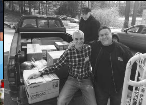
Medtronics of Littleton collected and donated over 350 pounds of food and 7 turkeys during their annual Thanksgiving food drive for Loaves & Fishes!