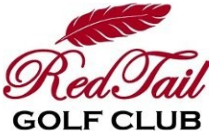
Red Tail Golf Club sponsored a Turkey Shoot raising $565 in gift cards and 32 turkeys for our Thanksgiving Dinner event!