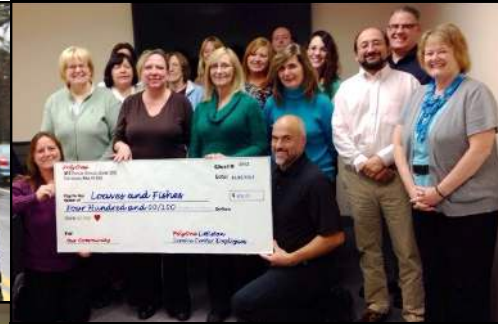
Before Thanksgiving, the 17 employees over at PolyOne Distribution in Littleton collected $400 in donations by "paying" to dress down in the office!