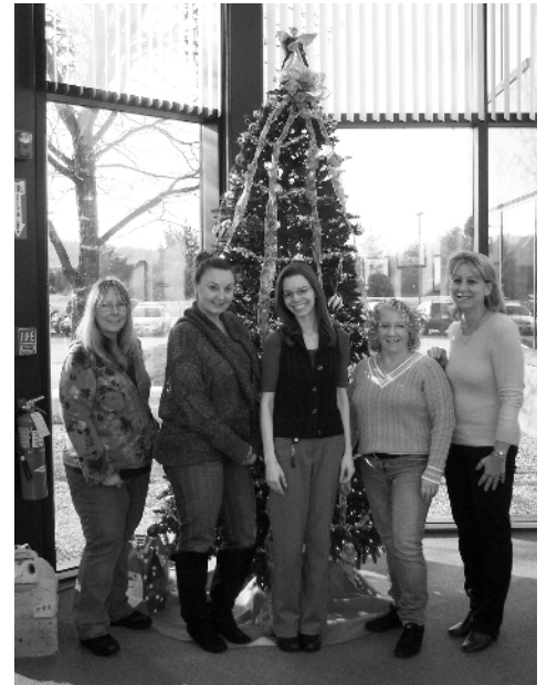
Above, Employees of Vitasoy USA supported our Shop For Your Kids Program by sponsoring a toy and gift card drive.