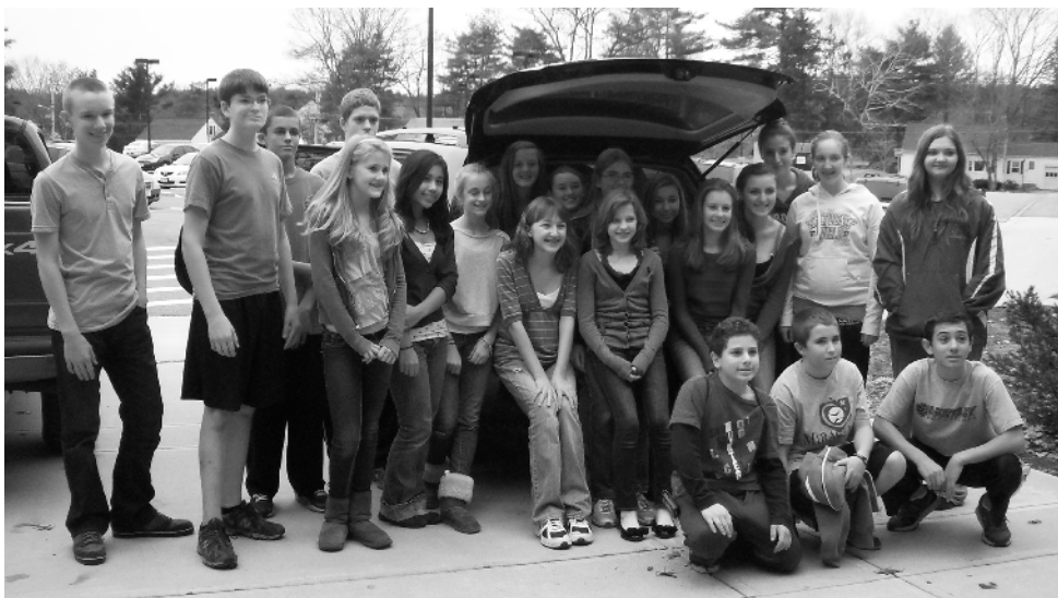
Left, Students from Littleton Middle School collected 4000 items of food for L&F. Great job!