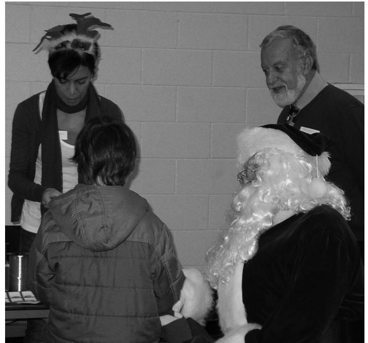
Below, Some of our volunteers really dressed-up for the occasion.