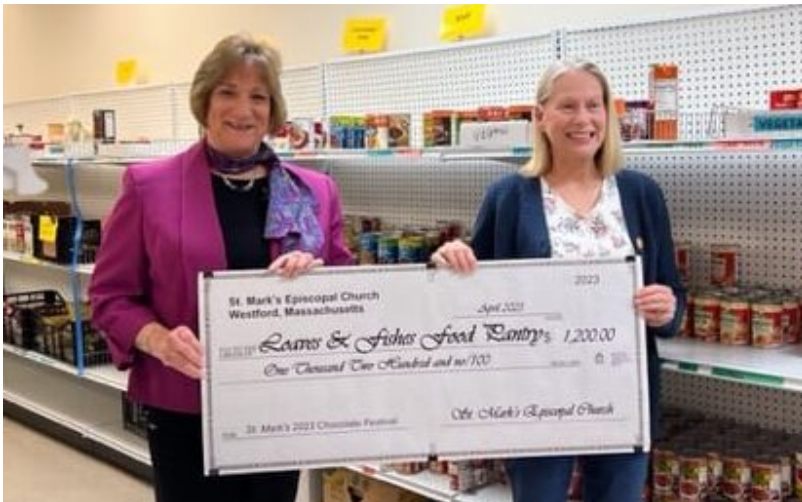
ST. MARK'S EPISCOPAL CHURCH - Westford made an assortment of chocolate goodies, packaged them and sold them to raise funds to support area charities. We were honored to be one of the chosen non-profit organizations to receive a generous donation from them.