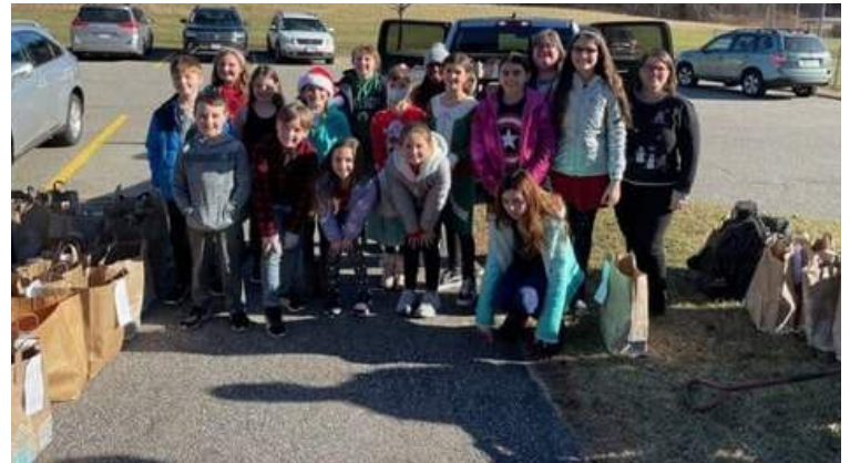
SWALLOW UNION ELEMENTARY SCHOOL - Dunstable collected an astounding 1360.8 lbs of food.

Aanya and the entire Page Hilltop community celebrated “kindness” and collected over 1,200 food items to donate to local pantries.