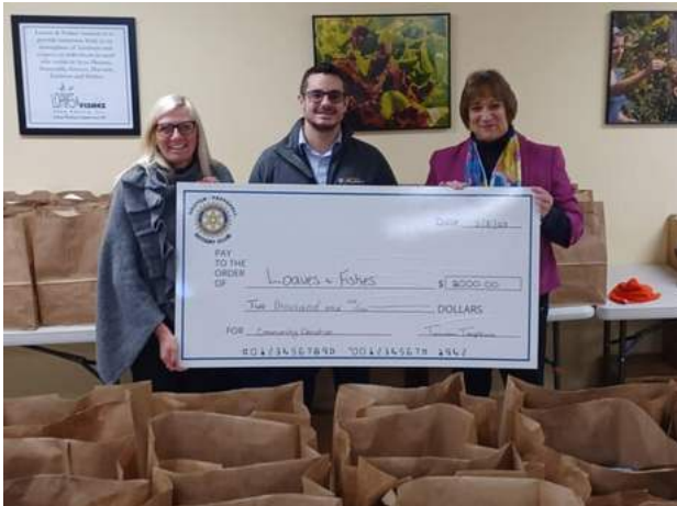
The GROTON-PEPPERELL ROTARIANS have been loyal supporters for many years!

Many businesses and community organizations supported Loaves & Fishes last year.