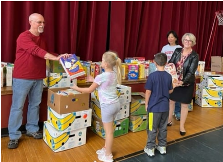
Students at the LURA A. WHITE SCHOOL - Shirley collected over 500 boxes of cereal for Loaves & Fishes!

THE YOUNG PEOPLE IN OUR COMMUNITY REALLY MADE A DIFFERENCE!