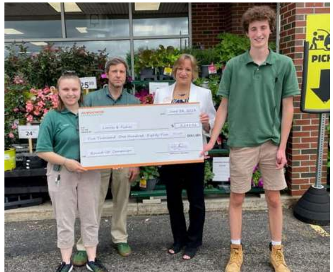
AUBUCHON HARDWARE - Littleton surprised us with a very large donation raised from their Round-Up fundraising campaign!