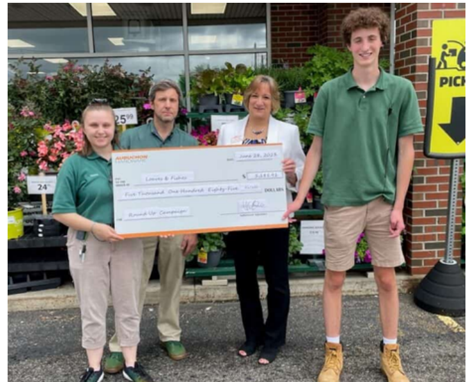
AUBUCHON HARDWARE - Littleton surprised us with a very large donation raised from their Round-Up fundraising campaign!