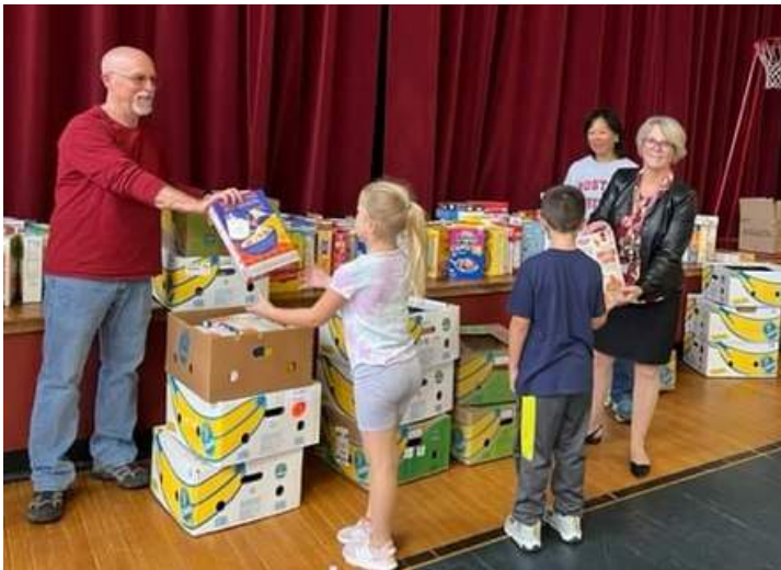
Students at the LURA A. WHITE SCHOOL - Shirley collected over 500 boxes of cereal for Loaves & Fishes!

THE YOUNG PEOPLE IN OUR COMMUNITY REALLY MADE A DIFFERENCE!