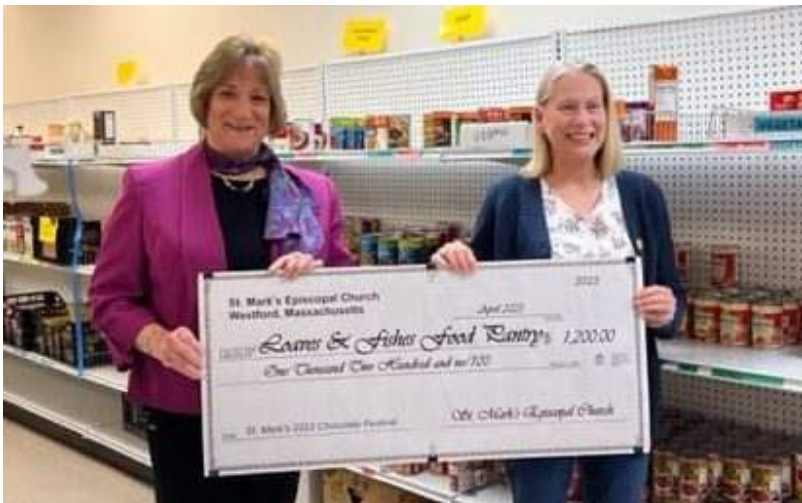
ST. MARK'S EPISCOPAL CHURCH - Westford made an assortment of chocolate goodies, packaged them and sold them to raise funds to support area charities. We were honored to be one of the chosen non-profit organizations to receive a generous donation from them.