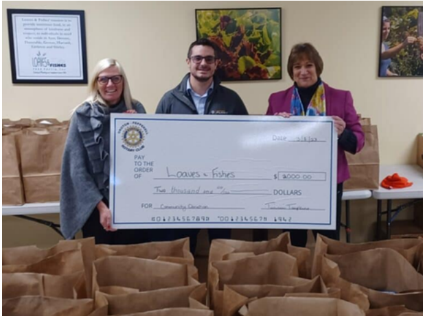
The GROTON-PEPPERELL ROTARIANS have been loyal supporters for many years!

Many businesses and community organizations supported Loaves & Fishes last year.