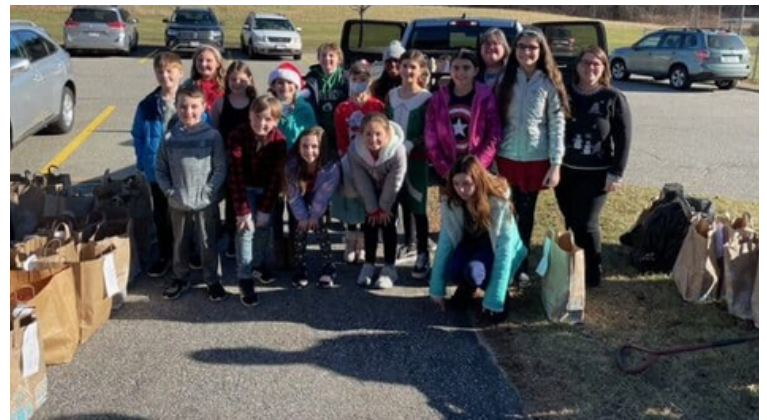
SWALLOW UNION ELEMENTARY SCHOOL - Dunstable collected an astounding 1360.8 lbs of food.

Aanya and the entire Page Hilltop community celebrated “kindness” and collected over 1,200 food items to donate to local pantries.