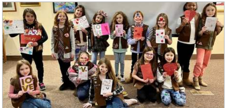
These adorable Brownies from TROOP 70510 - Groton made Valentine's Day cards for the clients at Loaves & Fishes and organized a food drive to benefit the Pantry in honor of a fellow scout.