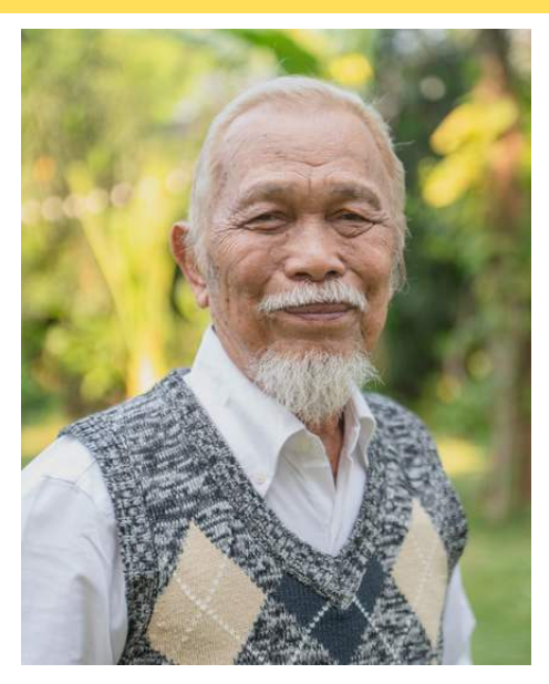
"Thank you so much for what you do, it makes such a difference. There were times before I came here that I didn't have anything to eat."

Contact our Client Counseling Team today for more information.