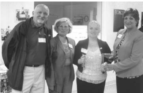
Rotary Club of Littleton receiving the 2015 Outstanding Community Partner Award in June