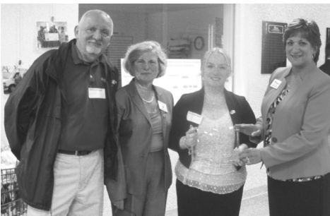
Rotary Club of Littleton receiving the 2015 Outstanding Community Partner Award in June