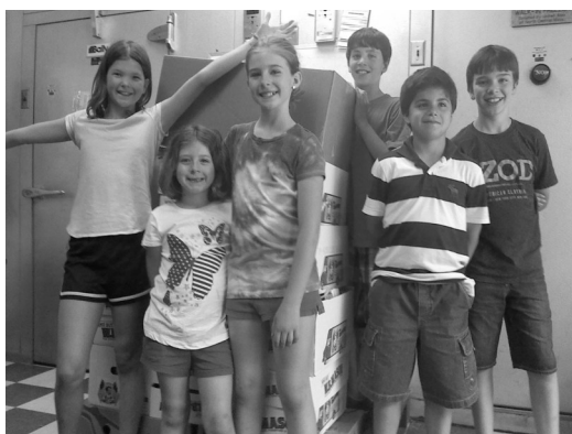
4th graders at Hildreth Elementary School in Harvard held a school-wide food drive for Loaves & Fishes