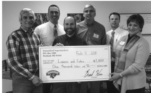
Hannaford Supermarket in Ayer has supported Loaves & Fishes for many years, and we were sad to see the store close!