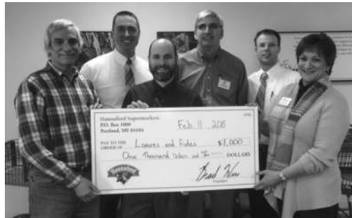
Hannaford Supermarket in Ayer has supported Loaves & Fishes for many years, and we were sad to see the store close!