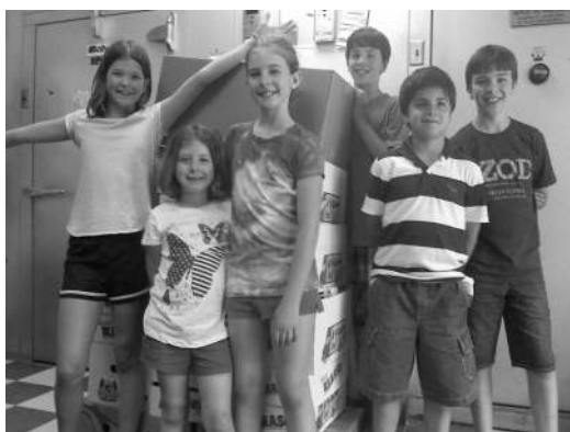
4th graders at Hildreth Elementary School in Harvard held a school-wide food drive for Loaves & Fishes