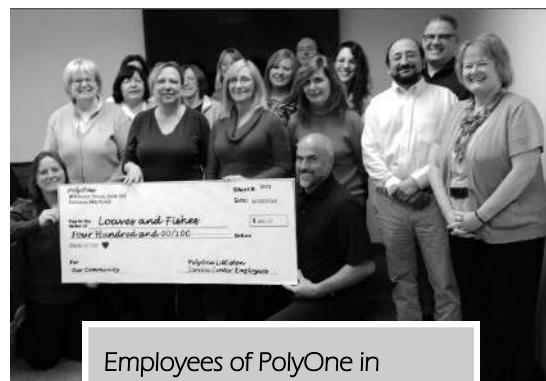
Employees of PolyOne in Littleton dropping off a donation