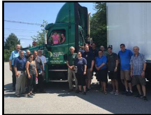
A great partner, Catania Oils of Ayer, delivered over 7,000 pounds of food to the Pantry, enough to feed a large family of 5 for one year!