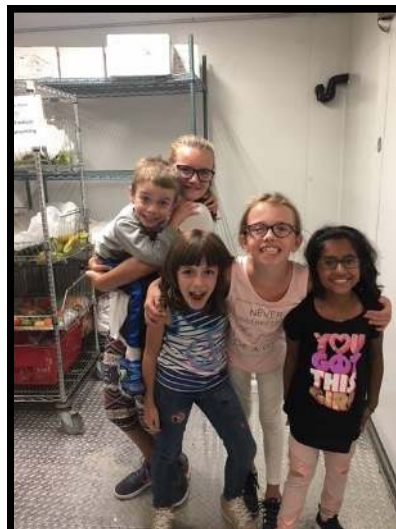
These young people are truly making a difference! They held lemonade stands over the summer and raised $539.

...and there are many other donors who wish to remain anonymous. We made every effort to include all of our Harvest Club Partners. Please accept our apologies and let us know if you have been missed.