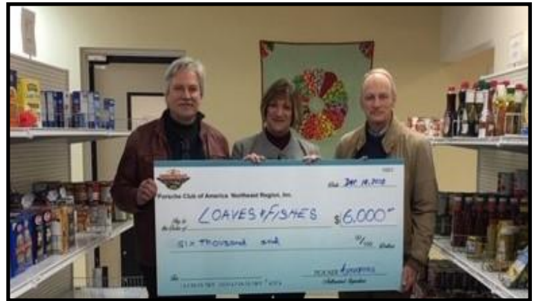
Loaves & Fishes received a donation in the amount of $6,000 from our good friends, PORSCHE CLUB OF AMERICA NORTHEAST REGION .