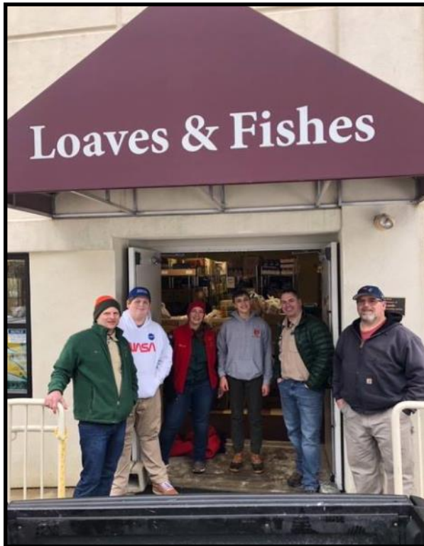
THE BOY SCOUTS OF AMERICA—TROOPS 1 & 13 held a food drive at Market Basket-Littleton and collected over 2,000 pounds of food valued over $3,400 for the Pantry!