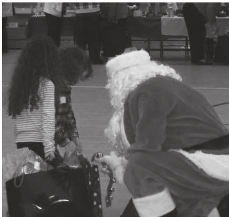
Santa shares a moment with the children.