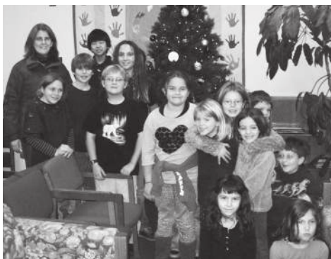
Students at the Oxbow School, Devens, visited the Pantry recently to drop off donations.