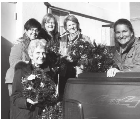
The Groton Garden Club donated beautiful boxwood arrangements for our Shop for Your Kids Program.