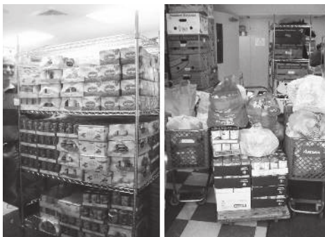
Employees of the Johnson Matthey Chemistry Development Team sponsored a little friendly competition between departments and collected 2,300 cans of vegetables.