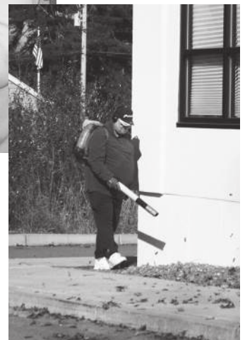
The 2nd Annual Client Clean-Up Day was held on November 10th. Fourteen clients helped spruce up the grounds by raking leaves, clearing brush, washing windows, and cleaning the inside of the building. It was wonderful opportunity for clients to give back to the community and say thank you for the support they have received.

"Without people like the people at Loaves & Fishes, I don't know where we would be."