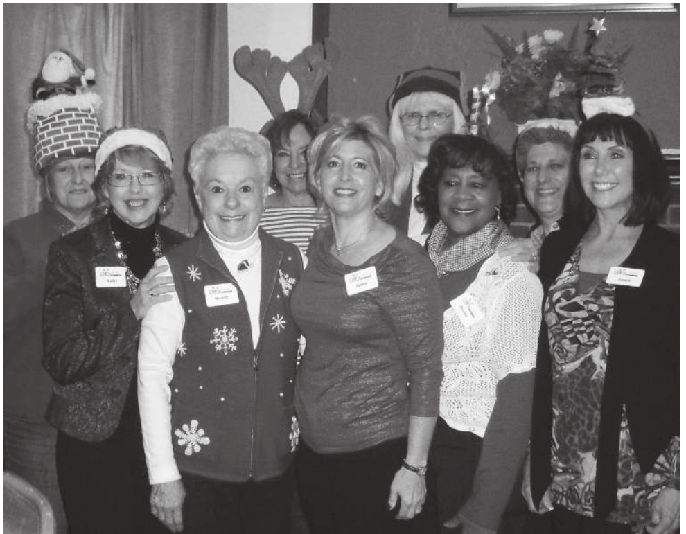
The Shop for Your Kids Team did an excellent job organizing this event.