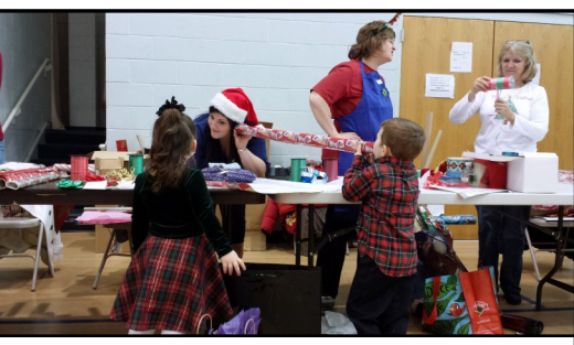
Santa's "elves" wrapping gift selections!