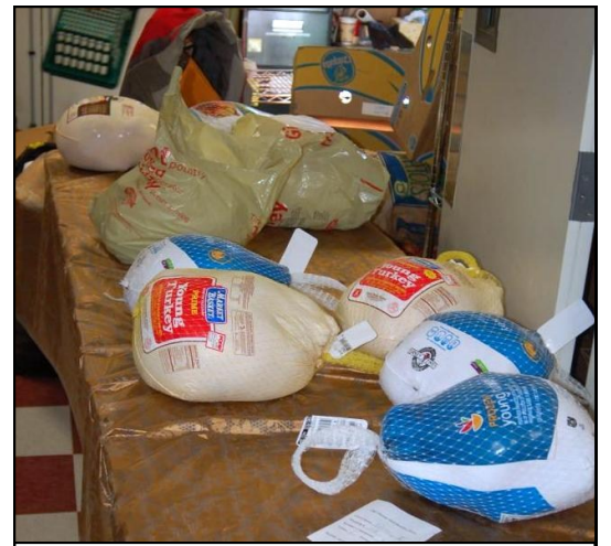
Turkeys ready to be distributed by volunteers during the Thanksgiving Dinner Distribution event November 18th