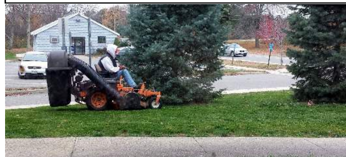
Thank you to Flynn Property Services out of Groton for donating lawn mowing services this past season! So appreciated!